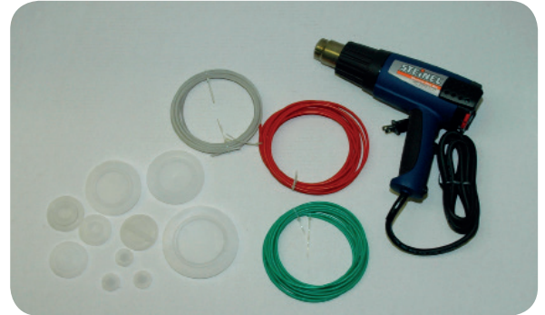
Tideland offers a variety of tool kits for minor repairs that may be ordered separately to assist in preserving buoys.